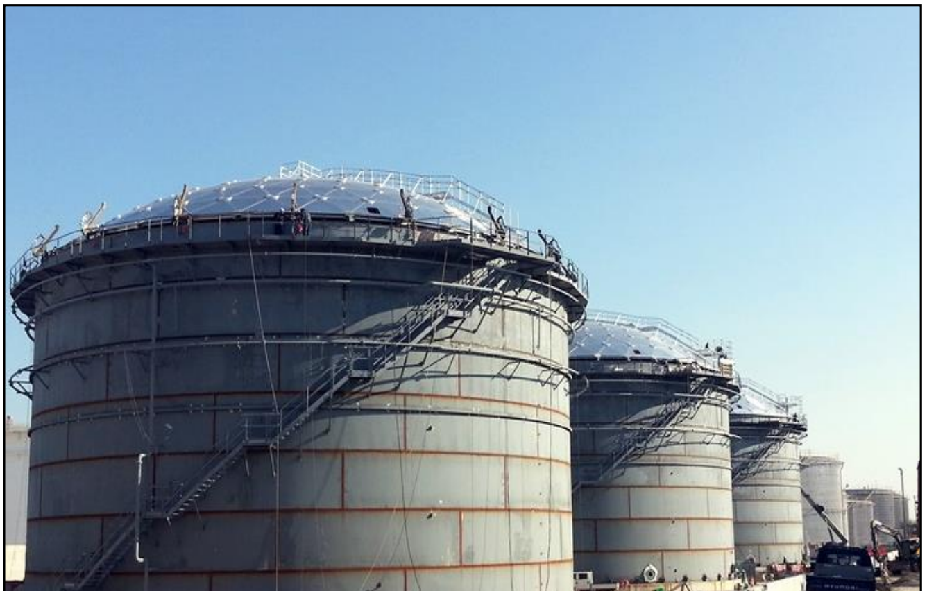
ADR 45m x 1 Tank, 33.5m x 3 Tanks, with Internal Floating Roof