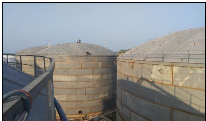
Sihanoukville, Cambodia IFR ID 34m x 6 Tanks, 2018